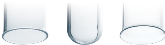
Open End Closed End Flared End