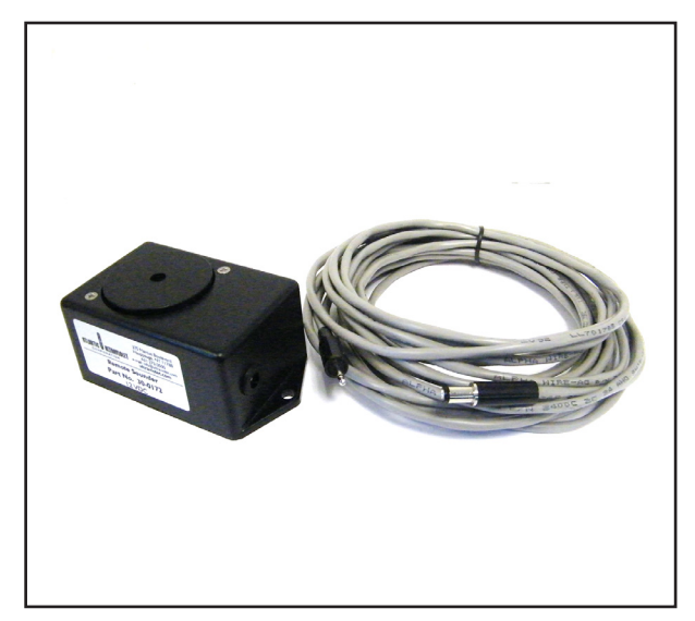
(Part #30-0172) The Remote Sounder is supplied with a 20 foot cable with a miniature plug that can be plugged into or extended to the alarm output socket of a Steralert <sup>™</sup> Lamp Status Sounder Alarm.

(Part #35-0151) AC power adapter provides continuous operating power to the Steralert <sup>™</sup> Lamp Status Sounder Alarm. Integral battery backup operates the alarm in the event of AC power failure.