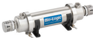
Model BIO-1.5 1.5 GPM