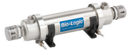
Model BIO-1.5 1.5 GPM

The Bio-Logic® Pure Water Pack™ has been designed to provide adequate filtering and germicidal ultraviolet dosage.