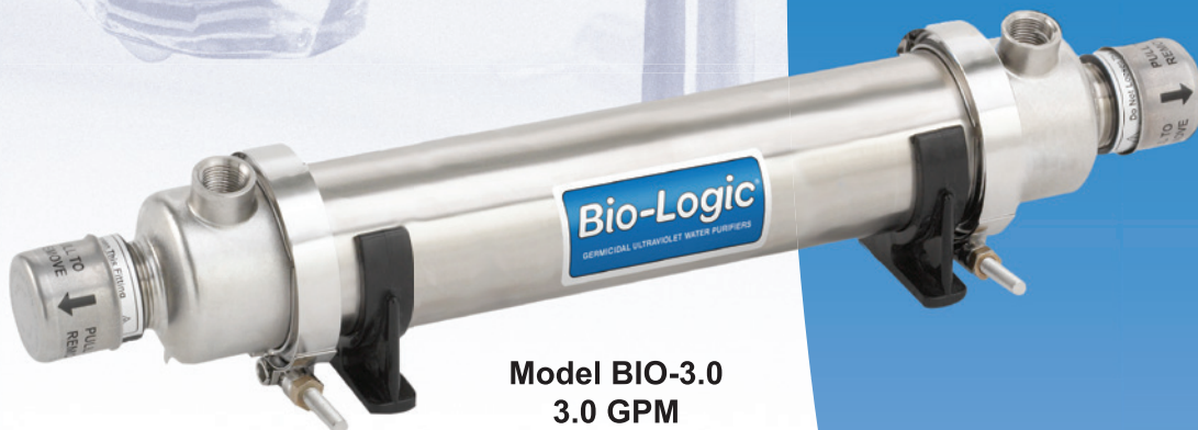
Model BIO-3.0 3.0 GPM