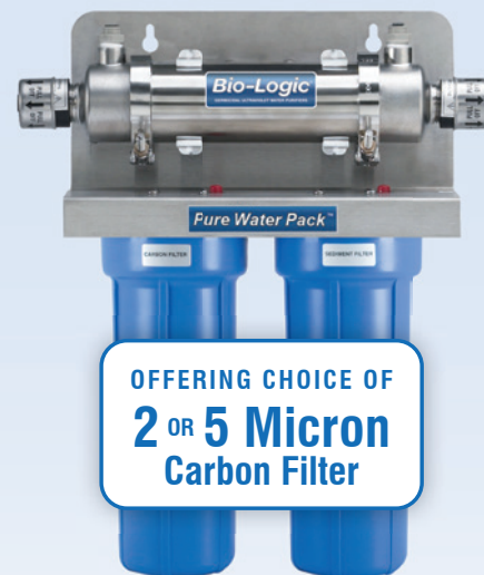
Model BIO-1.5 PWP 1.5 GPM