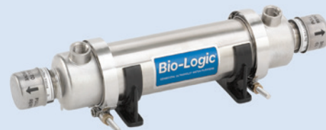
Model BIO-1.5 1.5 GPM