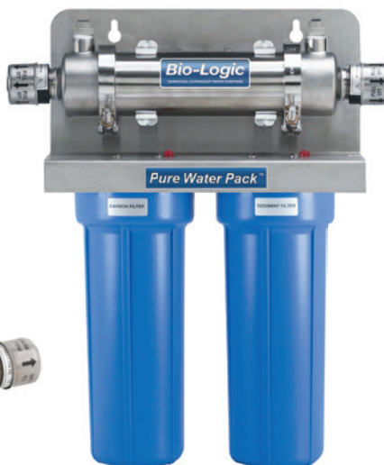
Model BIO-1.5 PWP 1.5 GPM