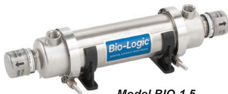
Model BIO-1.5 1.5 GPM

Since 1963 , we've been engineering and manufacturing germicidal ultraviolet equipment to prevent disease caused by contaminants in water, in air, and on surfaces. Our engineers bring each concept to a finished model, implementing stringent quality control procedures. Each product is manufactured with stainless steel and the highest quality materials to ensure the safety of personnel and room occupants. We stock an extensive inventory in our 37,500 square foot facility and ship throughout the world. Our knowledgeable team of UV-C specialists will provide effective and cost-conscious solutions for your home, business, industry, or institution.