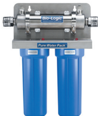
Model BIO-1.5 PWP 1.5 GPM