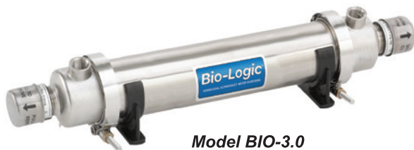
Model BIO-3.0 3.0 GPM