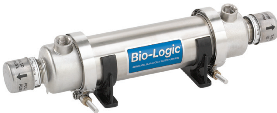
Model BIO-1.5 1.5 GPM