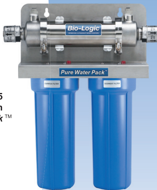
Model BIO-1.5 1.5 GPM with Pure Water Pack ™