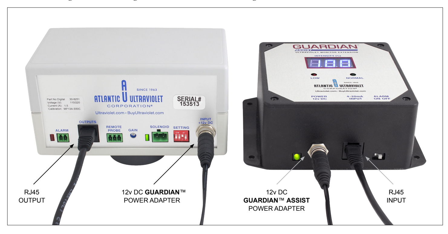
Figure 4 – Connecting GUARDIAN™ ASSIST to the Digital GUARDIAN™ Ultraviolet Monitor