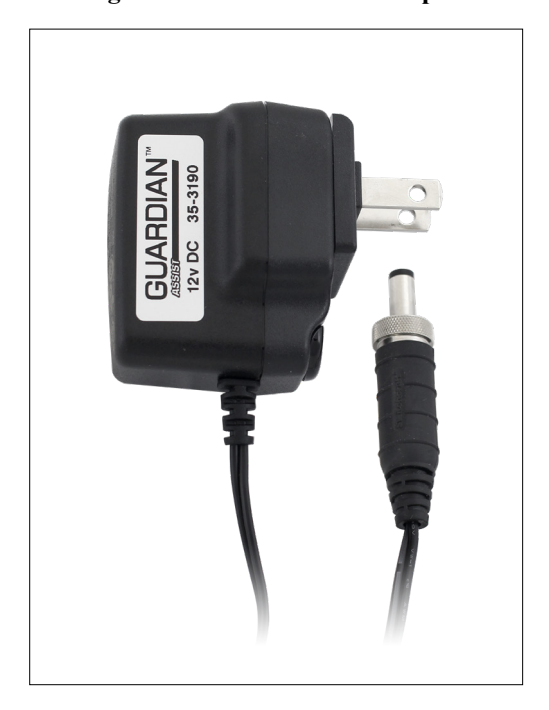
Figure 2 – 12v DC Power Adapter