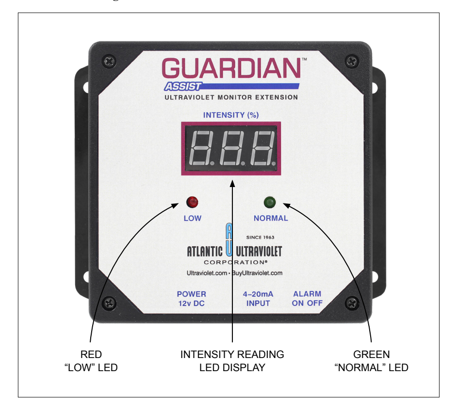
Figure 1 – GUARDIAN™ ASSIST Monitor Face